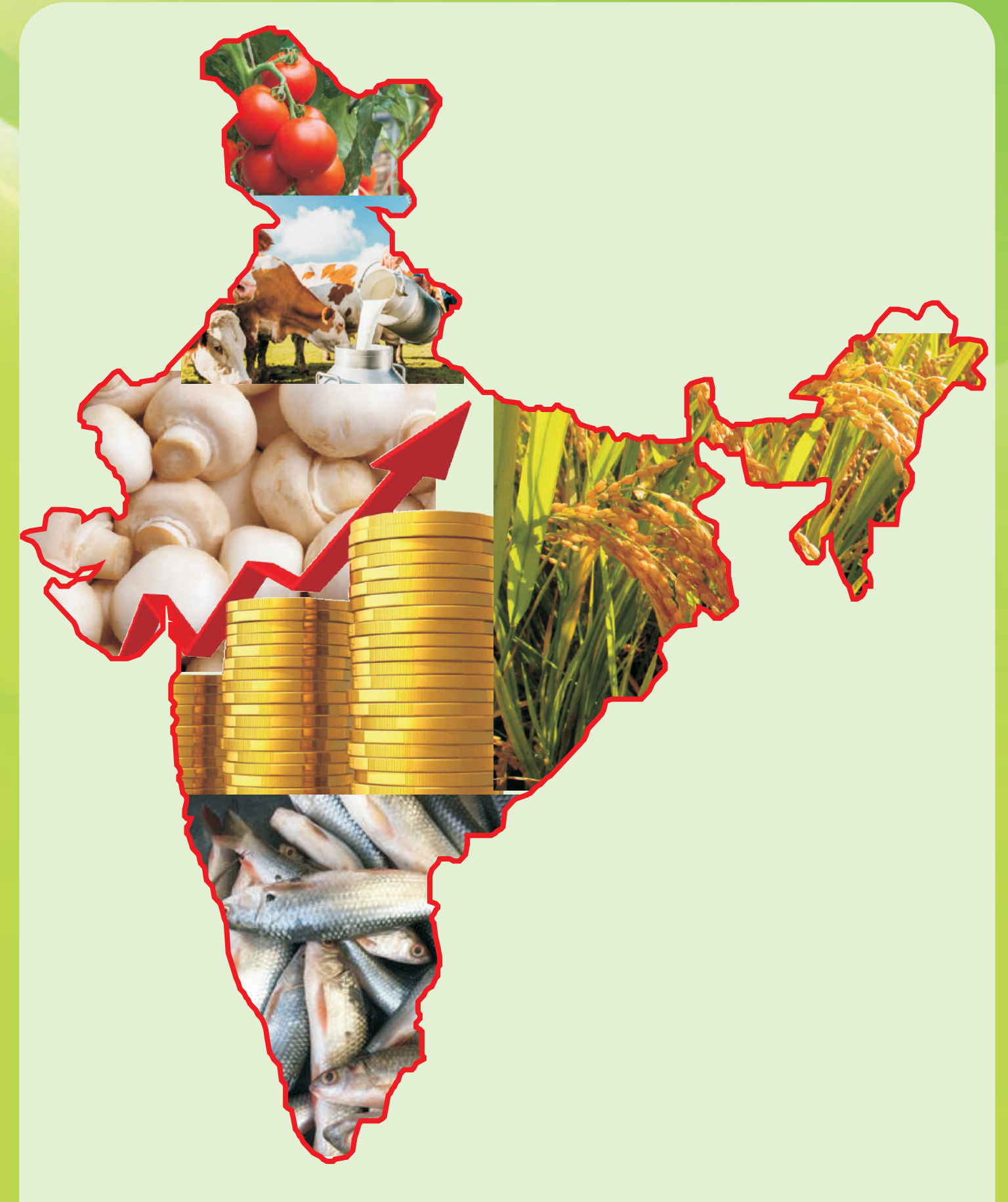
Online Registration Link For 21 Days National Training Course (NTC): https://aedsireg.auctech.in/#/mainpage

Glimpses of Agriculture Sectors for Aatmanirbhar Bharat